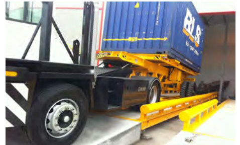
Napier Brown - 3x 18m Double Life's

The flagship of Libra's manufacturing is the Libra Double Life Weighbridge. Its advanced modular design and superior construction has proven popular with clients across many industries such as waste re-cycling and landfill, mining, logistics, construction and agriculture. The main obvious advantage of the Double Life weighbridge is that it is invertible. After many years of service, if the surface wears down, the whole deck can be inverted, revealing a fresh new weighbridge surface ready for countless more years of uninterrupted operation.