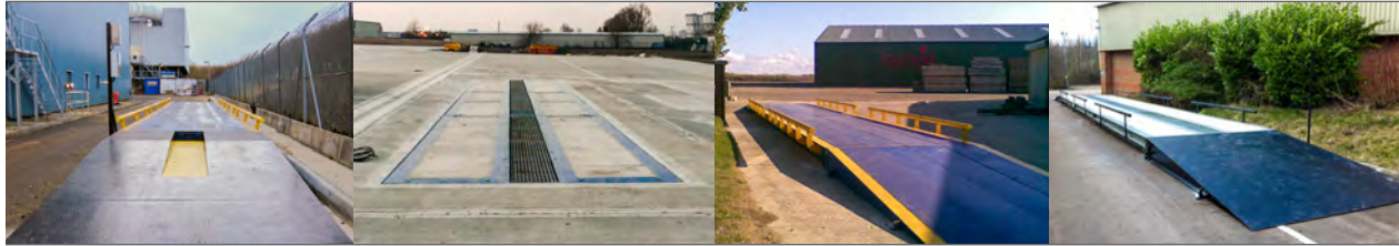
Lafarge Aggregates 20 metre Double Life